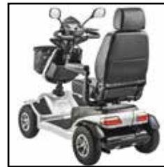
Modern LED lighting system