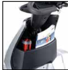
More space for storage