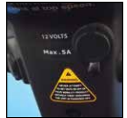
Handy 12 volt socket