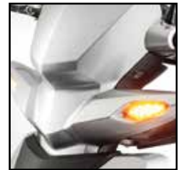
Modern LED lighting system