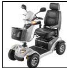
Modern LED lighting system