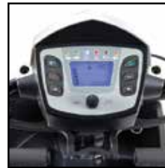
Digital LCD dashboard display