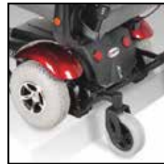
True six wheel design