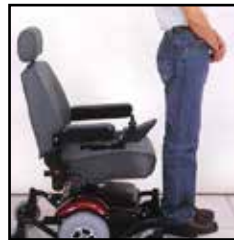
Excellent stability on footplate