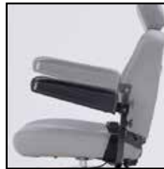
Height adjustable armrest