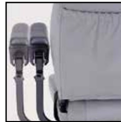
Width adjustable armrest