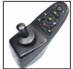
Dynamic Shark Controller